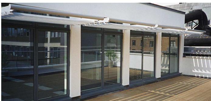
9 Orange Street

The theatre remained open throughout the construction period which increased the complexity of the project and the length of time on site. As well as the complete refurbishment/re-building of the interiors the brick exterior was rendered and new windows provided throughout in order to give the building a new identity/image.