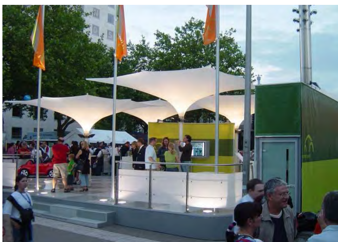
Brent Cross Patio

The proposal will also enhance an underused entrance to the Shopping Centre and rationalise and improve parking and pedestrian circulation.